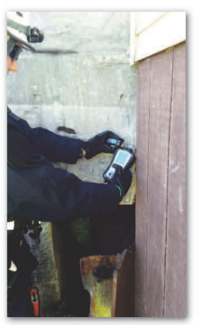
Search and rescue team members work to stabilize a concrete slab before extracting a simulated victim from a crushed vehicle (left), conduct a radiological survey on a patient (middle) and use a PRD and a four gas monitor to check for environmental hazards before cutting into the collapsed structure (right).