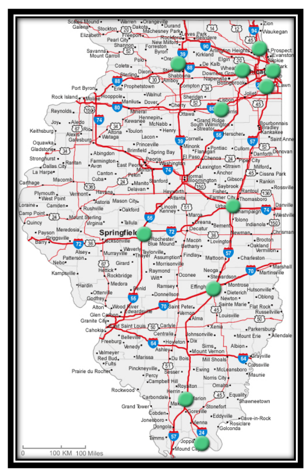
Locations of IMERT trainings and exercises in FY2017

IMERT also provided "real world" training opportunities by partnering with other response agencies to allow for joint exercise participation. IMERT routinely trains with the Radiological Assessment Field Team (RAFT) and Statewide Weapons of Mass Destruction (SWMD) Team.