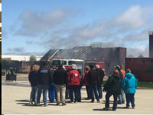
IMERT provides several types of trainings to its volunteers depending on the subject matter including immersion, hands-on, lecture, and simulation