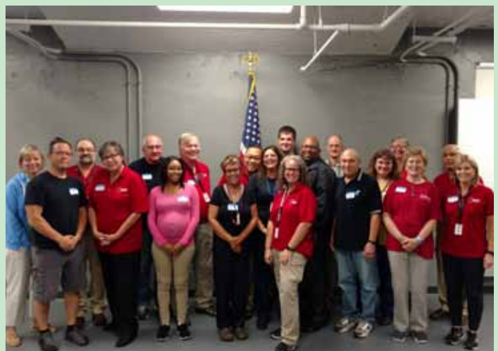
IMERT attendees from a CCHS session of the Deployment Operations Course. We hope to see you all at a session soon!